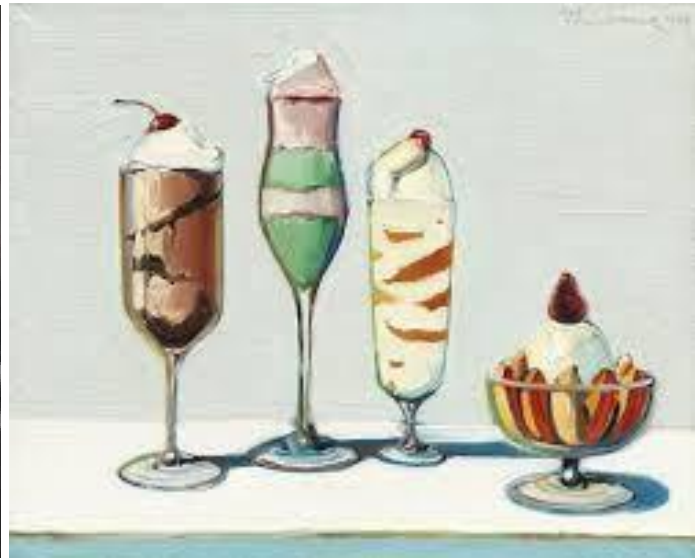
Wayne Thiebaud, Confections , Oil on Canvas, 1962

Artists reflect upon the nature of sensory awareness. This awareness may come in many ways at any time. The way the light falls across a face, long grass waving in the breeze, or reflections on the surface of water can spark it. Or it may come by sound: the crack of a thunderbolt, the cacophony of frogs after a late Spring rain, a waterfall. Sometimes Art activates these feelings as a kind of a mixture of pleasure and suffering. These feelings get lodged in our being. We want them and search for more of them. Our awareness becomes attuned to them: Shapes in the clouds, scents in the garden, songs of our ancestors, life-changing events. We use these connections to stay alive. They wake us up and activate deep emotion. They inspire the art we make.