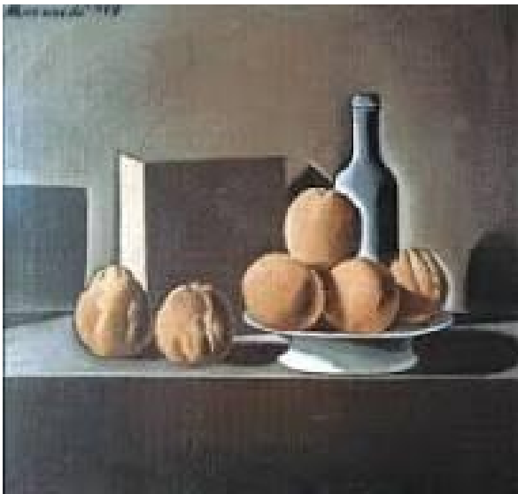
Thomas Morandi, Still Life , Oil on Canvas, 1919

Many other artists attribute other artist's artworks as a primary inspiration for their work. Wayne Thiebaud acknowledged many influences: Old Masters including Rembrandt and Velázquez; modernists like Matisse, Cézanne, and Morandi; and his friendship with Diebenkorn. He said, "Painting is life for me. It's kind of a miracle."