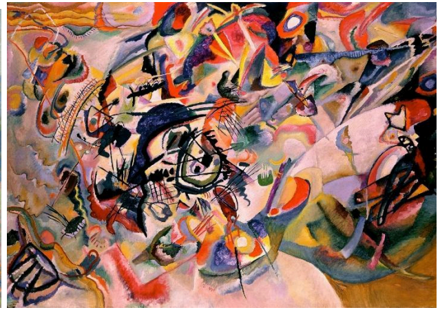
Wassily Kandinsky, Composition VII , oil on canvas, 1913

Many other artists attribute other artist's artworks as a primary inspiration for their work. Wayne Thiebaud acknowledged many influences: Old Masters including Rembrandt and Velázquez; modernists like Matisse, Cézanne, and Morandi; and his friendship with Diebenkorn. He said, "Painting is life for me. It's kind of a miracle."