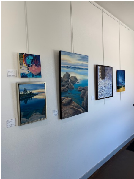
Left Wall - 12 feet x 9 feet