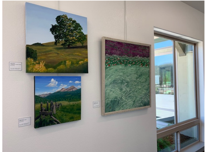
Right Wall - 6 feet x 9 feet