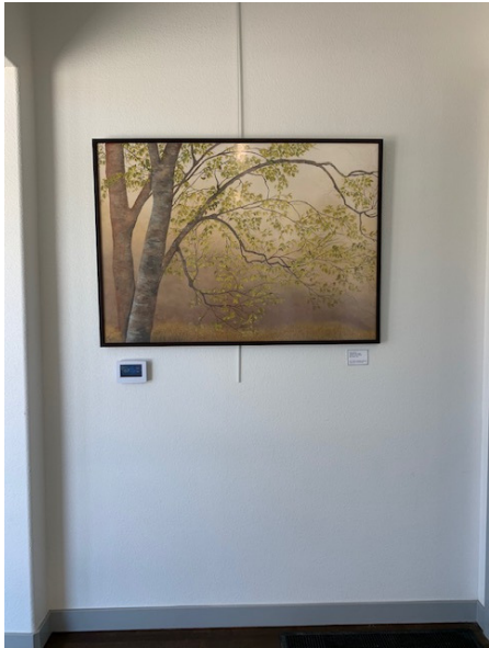
Entry Wall - 6 feet x 9 feet